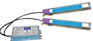
UUVS-CBAR-D Dual Lamp Germicidal (UVC) Surface Cleaner