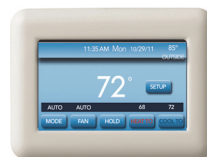
TSTAT0201CW Recommended (sold separately)