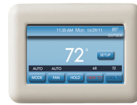
TSTAT0201CW Recommended (sold separately)

* Applies to original purchaser/homeowner, some limitations may apply. See Warranty certificate for complete details.