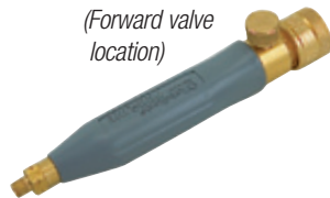
PLF-A5 Proline® (0386-0872)