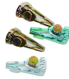
156T1978AD12 12 Pack of 156T1978A Trippers for T100, T7000, and WH40