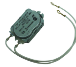
WG1573-10DMX 208-277 VAC, 60 Hz Motor for T102, T104, T106, T172, T174, WH40