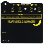
124T1952 Insulator for Double-Pole Time Switch (T103, T104, T105, T173, T174, T175, T176, T185, WH40)