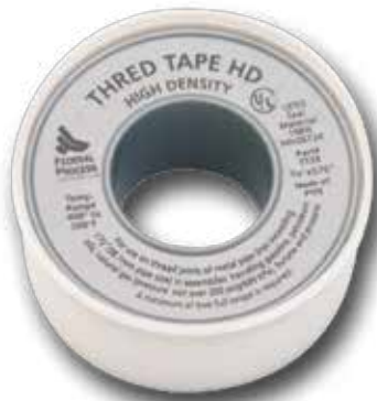
Thred Tape HD High Density