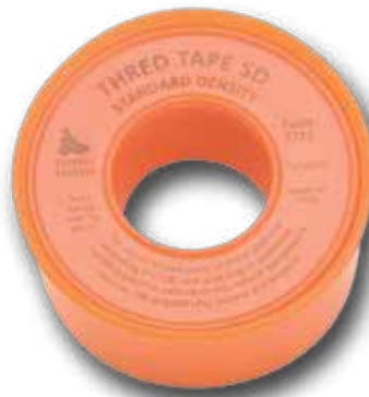
Thred Tape SD Standard Density