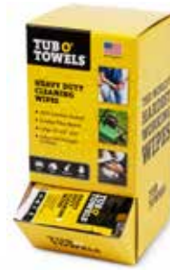
Gravity Feed Box Single Packs — # TW01-GR