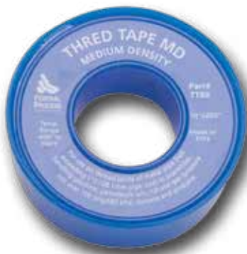
Thred Tape MD Medium Density