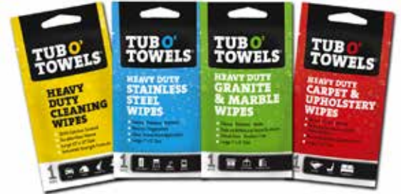
Individually Wrapped Single Packs 10" x 12" Tub O' Towel Single Pack