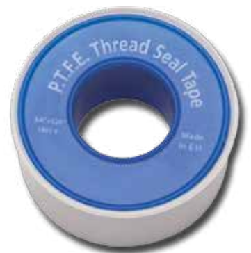
Economy Tape Low Density