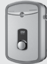
RTEX-08, RTEX-11, RTEX-13