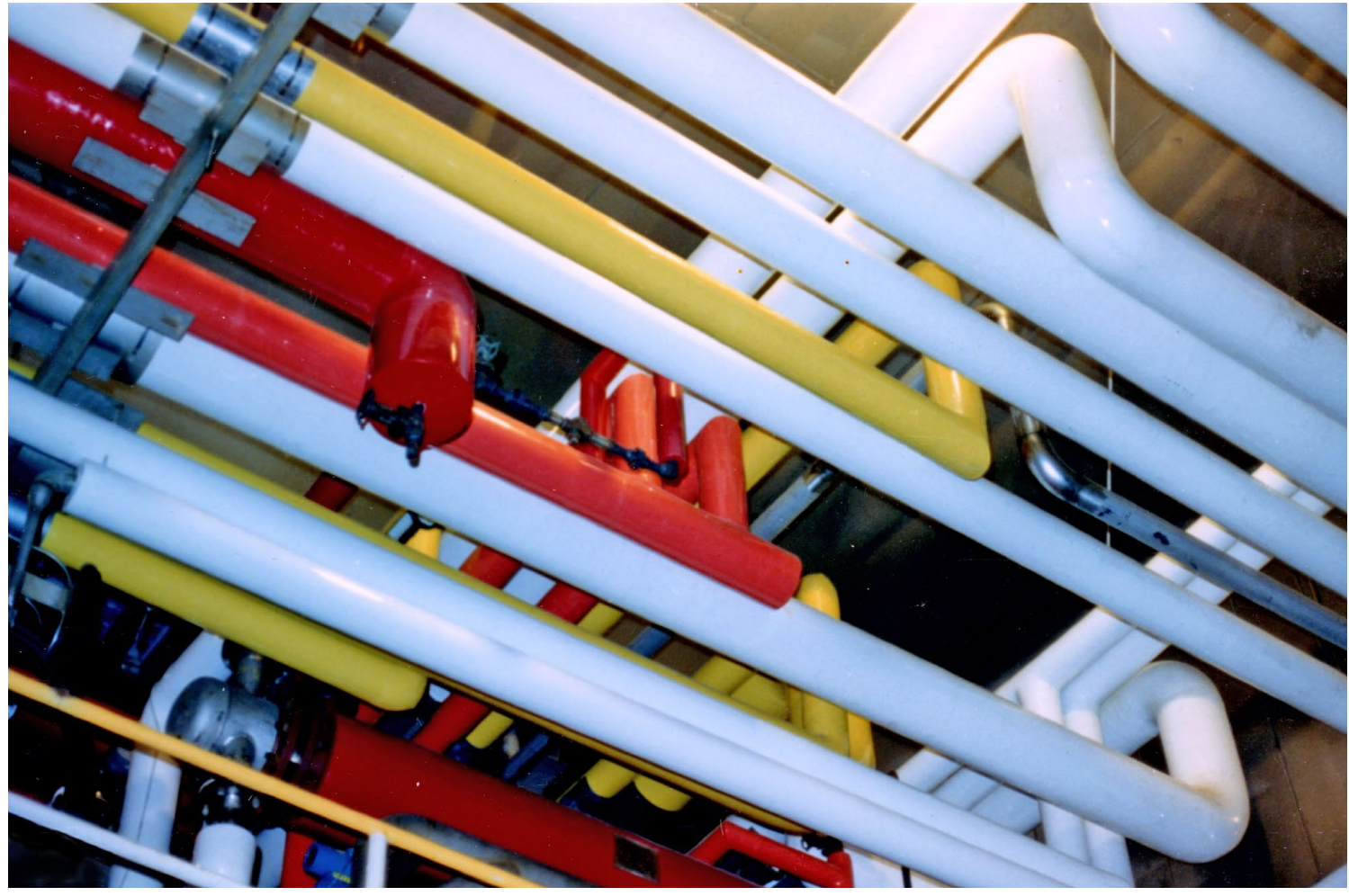
Aerocel® with SaniGuard™ available in white only