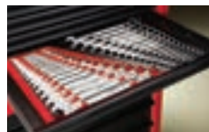
Innovative Storage Solution