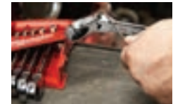
Adjustable Set Screw