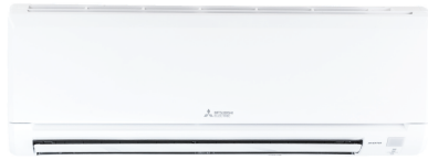
Indoor Unit: MSZ-GL09NA