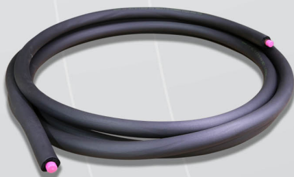
Type "H" Piece Insulated Copper Tube (Single Line)