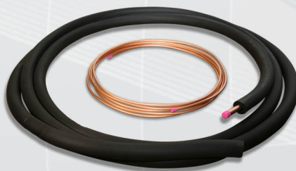
Type "F" Set Standard Plain End Line