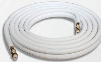
Type "B" Set Mini-Split Twin Tube (Joined)