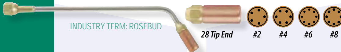
INDUSTRY TERM: ROSEBUD