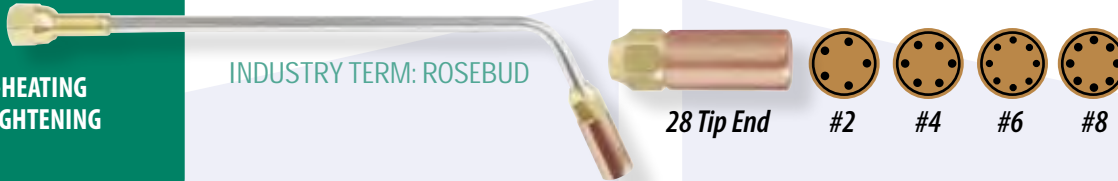
INDUSTRY TERM: ROSEBUD