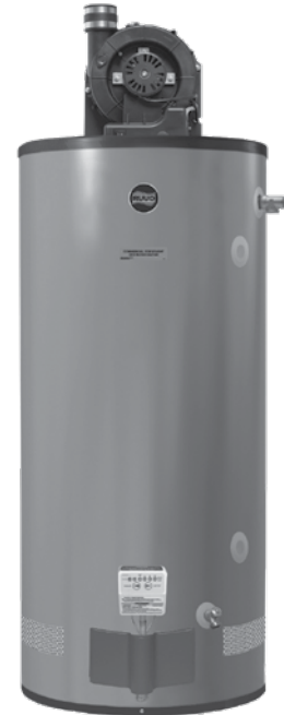
Ruud Power Vent 75-Gallon Capacity 75,100 Btu/h Natural and LP Gas

Safety and Construction | Design certified by CSA Laboratories: a) To meet all safety and construction requirements of ANSI Z21.10.1. b) As an automatic storage water heater. c) For operation of combustible floors, in alcove, and closet installations. d) For combination water heating and space heating applications. All models are North Carolina code compliant. Certified for 150 PSI maximum workin.5ressure.