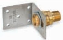
Termination Bracket Fitting