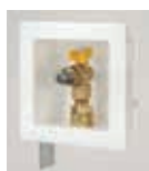
XR Outlet Box