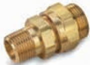
Termination Fitting with No Flange