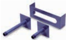
Straight Stubs & Stub Bracket