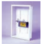
Gas Load Center