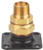
Termination Fitting with Square Flange