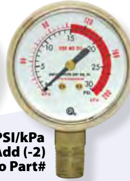
PSI/kPa Add (-2) to Part#