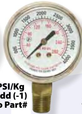
PSI/Kg Add (-1) to Part#