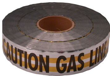
Tracer Tape metallic tape - 1,000' roll