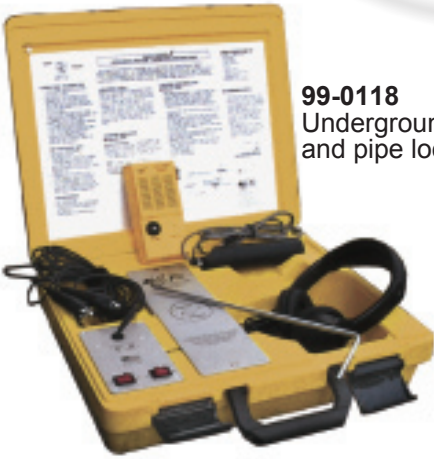
99-0118 Underground cable and pipe locator

Free Freight on all orders over $400. some exceptions apply