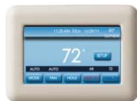
TSTAT0201CW Recommended (sold separately)

* For owner occupied, residential applications only. See warranty certificate for complete details and restrictions, including warranty coverage for other applications.