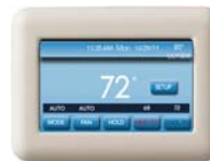
TSTAT0201CW Recommended (sold separately)

* For owner occupied, residential applications only. See warranty certificate for complete details and restrictions, including warranty coverage for other applications.