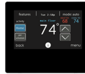
SYST0101CW Recommended (sold separately)

* Applies to original purchaser/homeowner, some limitations may apply. See Warranty certificate for complete details.