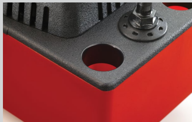
Four Inlet Holes

An elastomeric motor mounting gasket dampens vibration.