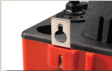
Metal Hang Tabs

Shatterproof stainless steel hang tabs have hole-and-slot design for easy mounting. Tabs are located on convenient 8" centers.