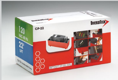
Full Color Packaging

Includes two 1/4" quick connect terminals to the built-in overflow switch allowing installer flexibility to connect air-handler shut-down. Switch features SPDT isolated contacts ready for connection to building automation systems. Also includes 60" lead kit to connect the overflow safety switch.