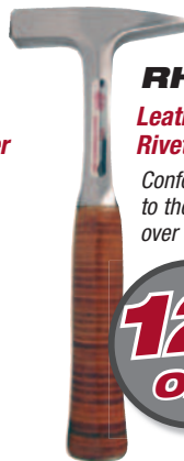
RH4 Leather Grippped Riveting Hammer Conforms perfectly to the user's hand over time.