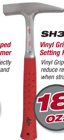
SH3V Vinyl Grippped Setting Hammer Vinyl Grip helps reduce recoil when struck.