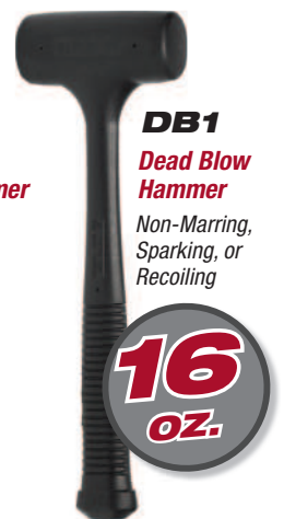
DB1 Dead Blow Hammer Non-Marring, Sparking, or Recoiling