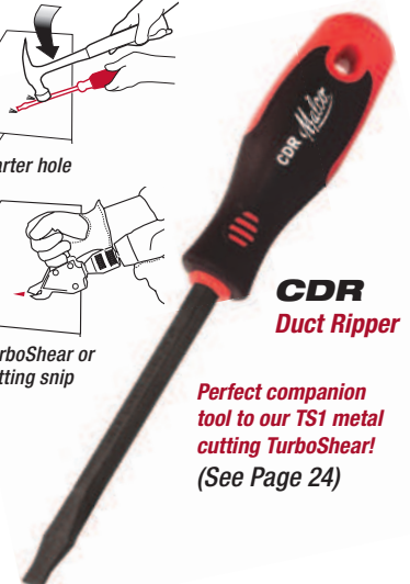
CDR Duct Ripper

Perfect companion tool to our TS1 metal cutting TurboShear! (See Page 24)