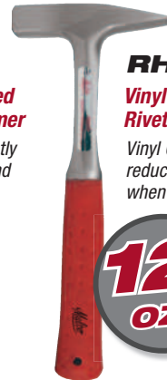
RH4V Vinyl Grippped Riveting Hammer Vinyl Grip helps reduce recoil when struck.