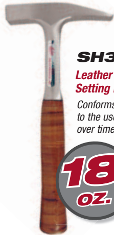
SH3 Leather Grippped Setting Hammer Conforms perfectly to the user's hand over time.