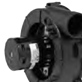
FIG. N A204