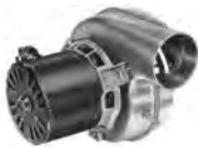
FIG. F A138