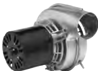
FIG. K A201