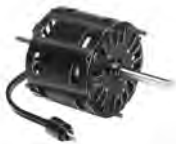
FIG. A D1152, D1154, D1101, D1103

NOTES: 13: 7.5M 370V Capacitor 75: Shell Turbo 68, low temp. oil (-40°F) 201: Not a direct replacement for 253-1194, but is an acceptable substitute