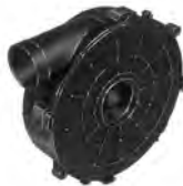
FIG. H A163