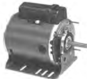
FIG. C D863