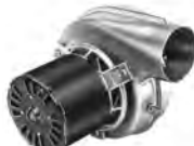
FIG. G A135, A205