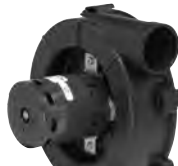
FIG. M A203