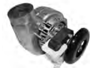
FIG. E A068