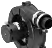
FIG. L A202