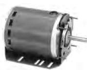
FIG. B D2862