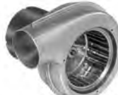
FIG. I A164