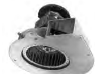
FIG. J A200