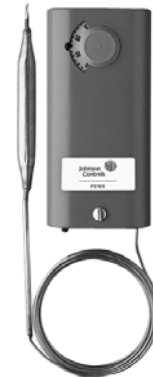
A19ABC-24 Remote Bulb Control