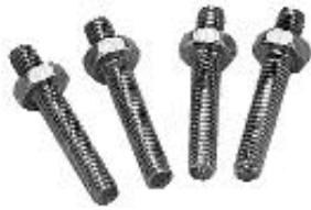
STOCK NO. 2087A MOUNTING STUDS 10-32 X 1" 4 per set (available separately)