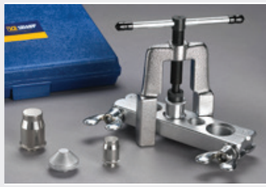
60455 large-size swages and flares for 3/4", 7/8" and 1-1/8" O.D. tubing