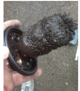
System contaminants trapped by the Fernox TF1 Total Filter