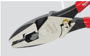
Easily Cuts #2 ACSR * When compared to other ACSR cutting lineman pliers