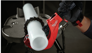
Adapt to Cut 3" PEX