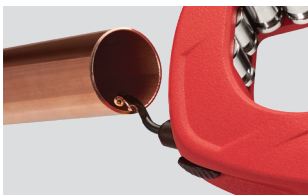
Built-In Reamer on 48-22-4252