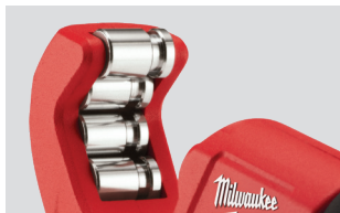
Chrome Rollers Rust Protection