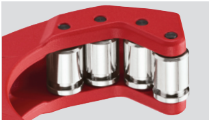
Chrome Rollers Rust Protection