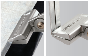
3/8" & 1" Markings More accurate folds