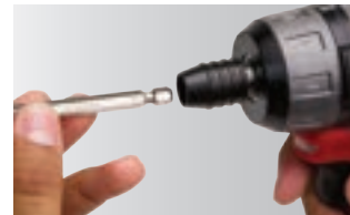
Power Tool Compatibility