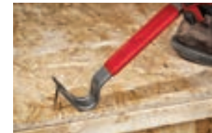
High Leverage Shepard's Hook