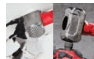
Dual Face Versatility Smooth and milled face