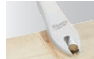
Precision Beveled Edge, Better Access