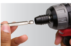
Power Tool Compatibility