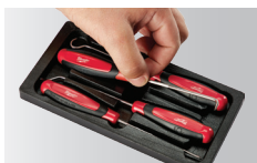
Easy Access Storage Tray