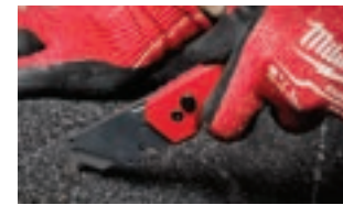
Ideal for Roofing