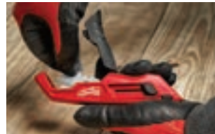
Holds up to 5 Blades