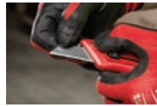
Tool-Free Blade Change