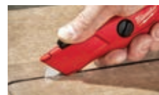
Ideal for Cartons