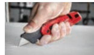
Ideal for Drywall