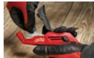
Holds up to 5 Blades