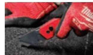
Ideal for Roofing