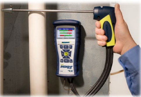
Intuitive setup screens and color graphics are sharp and clear in any setting. Unique hotspot finder detects optimal measurement site.

The Fyrite® INSIGHT® Plus is Bacharach's next-generation residential and commercial combustion analyzer featuring enhanced features and intuitive operation. This lightweight, American-made hand-held analyzer uses advanced technology to accurately measure, analyze and report test results to validate safe operation, install more efficient systems and save customers' money. With its easy to use Fyrite® User Software and exclusive B-Smart® CO sensor, the Fyrite® INSIGHT® Plus enables technicians and HVAC/R service representatives to upgrade software or install pre-calibrated sensors right in the field to avoid costly downtime and inconvenience.