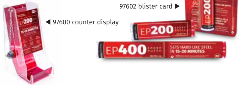
97602 blister card ▶

RECOMMENDED FOR • Bonding and filling metals and a variety of other materials