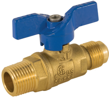
T-204 MIP x FL