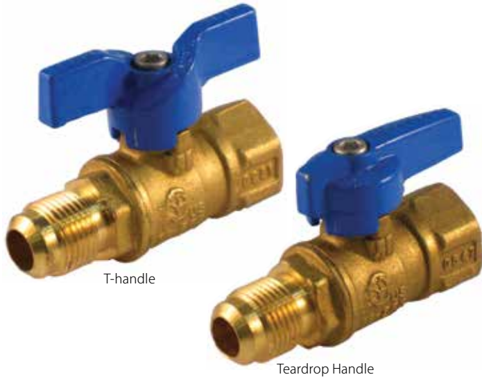
T-204 FL x FIP