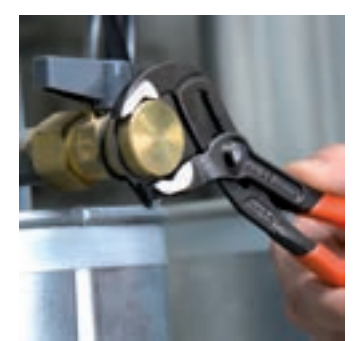
Fast and firm adjustment directly on the workpiece