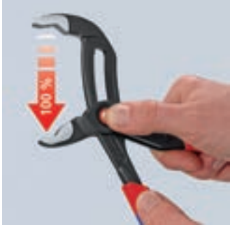
Press the button - open pliers completely

Adjustment directly on the workpiece is possible by simply sliding the pliers handle. The hinge bolt locks itself with the first workload. The gripping width of the pliers is then fixed and can only be adjusted by pressing the button. The hinge bolt must be released by pressing the button and the pliers must be completely opened once to activate the QuickSet function again.