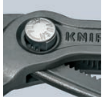
Fine adjustment by pushing a button: fast and comfortable

No more time-consuming presetting of the required opening size. Just position the upper jaw to the workpiece, push button and move close the lower jaw, ingeniously simple.