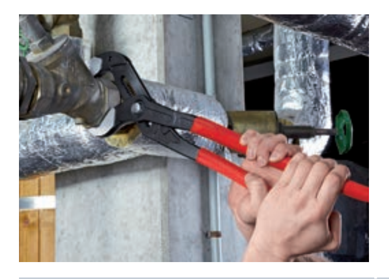
KNIPEX Cobra® XL length 400 mm – weight 1195 g