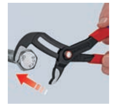
Position jaw - simply slide and close pliers