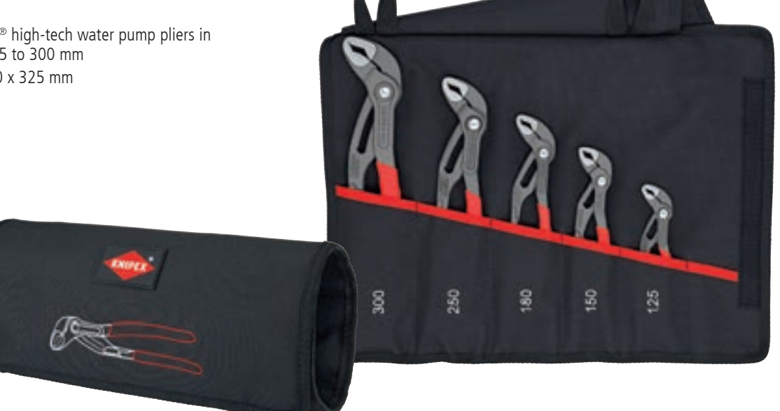
00 19 55 S5