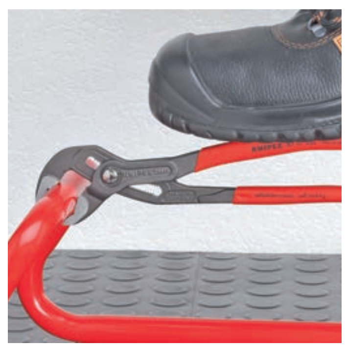
Teeth set against the direction of rotation have a self-locking effect and prevent slipping on the workpiece.