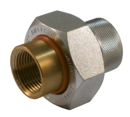
Brass FIP x Galvanized FIP