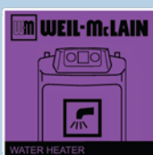
PROVIDING HOT WATER