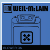
START/END OF HEATING CYCLE