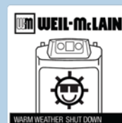
WARM WEATHER SHUTDOWN