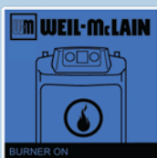
PROVIDING SPACE HEATING